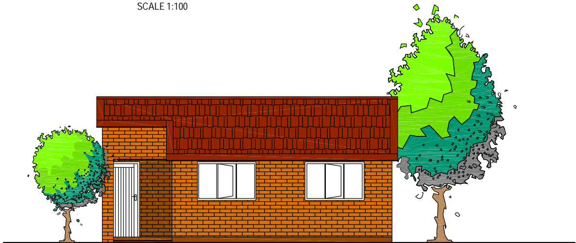
ELEVATION 2 SCALE 1:100